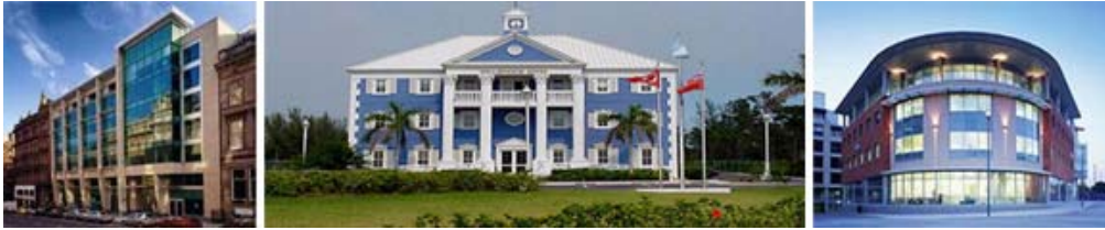
3 Of Over 100 Esperanza Clinics Worldwide